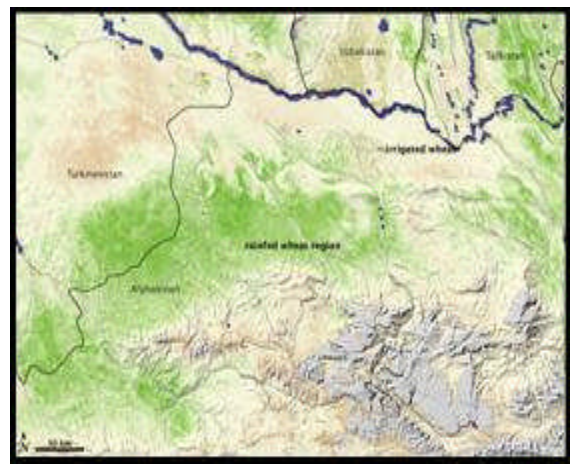
Image: NASA MODIS 250m Global View MODIS NDVI Anomaly, May 8, 2009, Northern Afghanistan, (courtesy of NASA Earth Observatory)