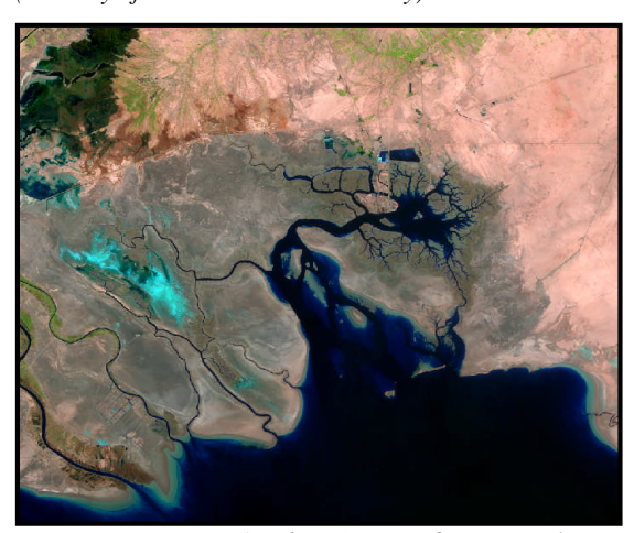
Image: ResourceSat-1 India's AWiFS 56m Regional View– Khuzestan Providence, IRAN, March 2009 (SWIR, NIR, R False Color Composite)